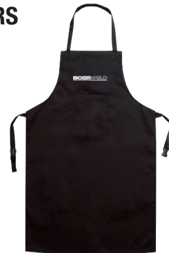
WFR FULL APRON