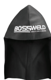
FR-40 SKULL CAP WITH NAPE