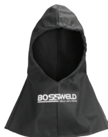
FR-40 WELDERS SNOOD