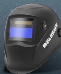
Pitch Black WSG1710