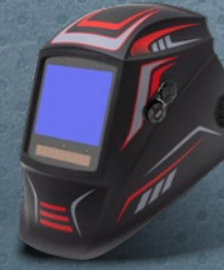
Galaxy Red WST2527