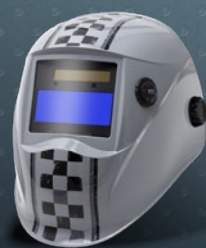
Slate Racer WSG2536