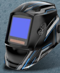
Blue Volt WST2528