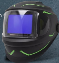
Solar Lift WSU2533