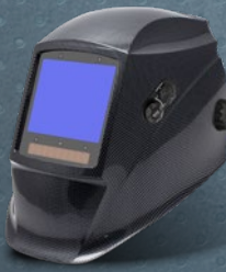
Carbon Fibre WST1602