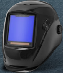
Dark Knight WSU1820