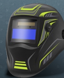
Neon Arc WSG2532