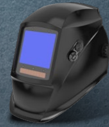
Pitch Black WST2529