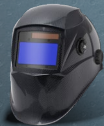
Carbon Fibre WSP1605