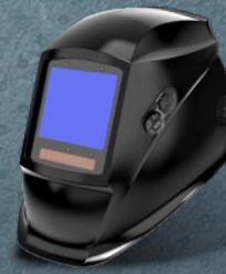
Dark Knight WST1923