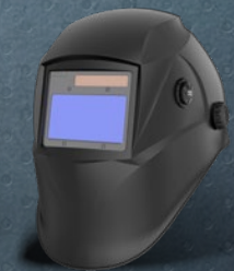
Pitch Black WSP2531