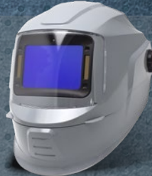
Armor Lift WSU2534