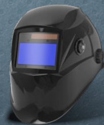
Dark Knight WSP1819